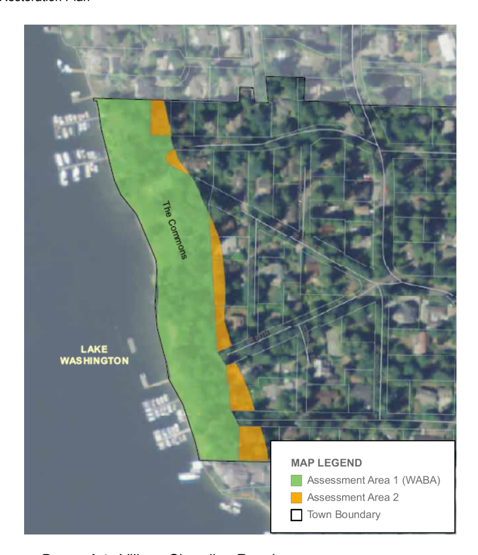
Figure 1. Beaux Arts Village Shoreline Reaches